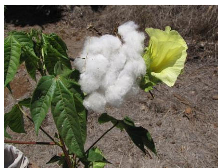
Sea Island cotton.