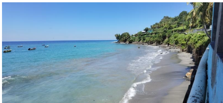
Waltham Bay, Grenada.

The former Waltham estate is now thickly forested in the hills which were once cleared for the cultivation of sugarcane, coffee, and cocoa. On the land closest to the sea, which is the most level, village homes have been constructed, and St